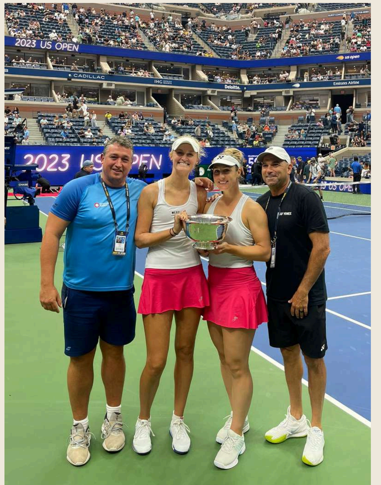
US Open Women's Doubles Champions