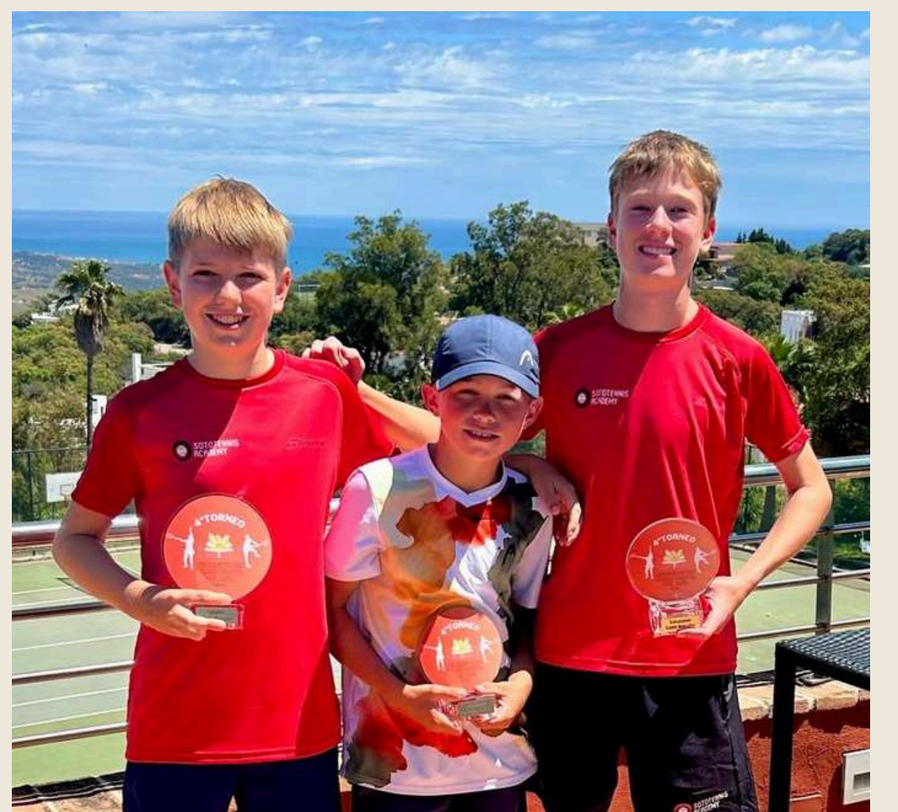
Hofssaes Tournament Champions