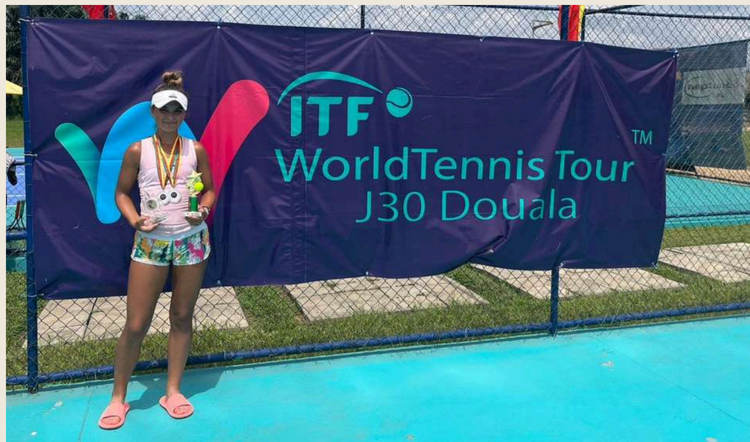
ITF J30 Champion