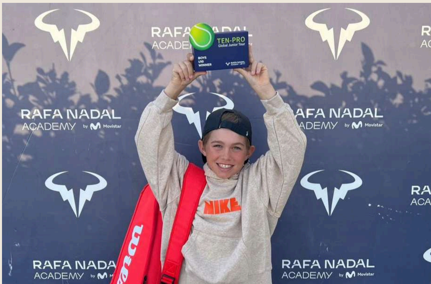
Ten Pro Champion

From local Spanish tournament victories to Grand Slam titles, we are here to support our athletes at every stage!